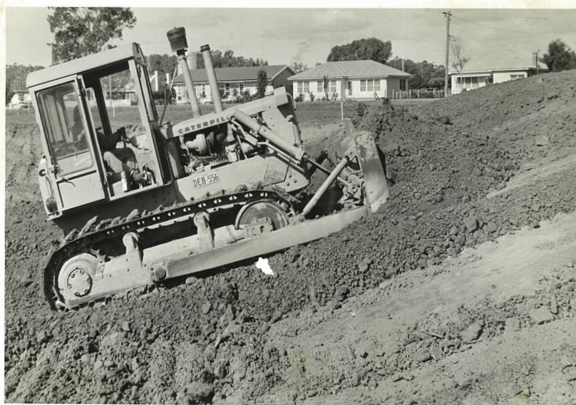
James Hunt SNR